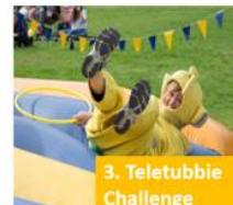
3. Teletubbie Challenge