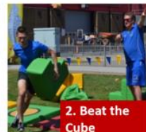
2. Beat the Cube