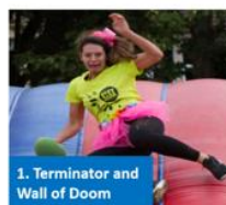
1. Terminator and Wall of Doom

Compete with other Trinity Teams to be crowned the Trinity Champions and win the Trophy! Games on the day include the Terminator, Wall of Doom, Beat the Cube and the Teletubbie Challenge.