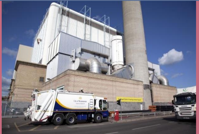
How SELCHP Energy Recovery Facility works