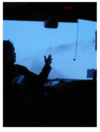
Tricky driving conditions but Dori took it in his stride..

Plan B was to drive the short but dramatic distance to the brand new interactive national lava museum.