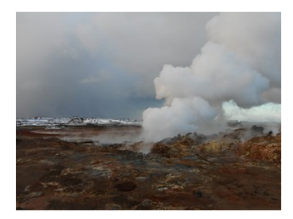
TGunnuhver Hot Spings the ground literally bubbled and smoked around our feet.

The last stop on our way to the airport was the an absolute highlight; the Gunnuhver Hot Springs followed by the Bridge Between Two Continents.