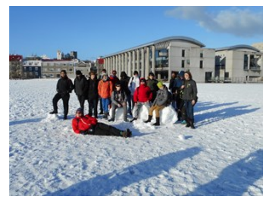
Small children play on the ice and build snowmen.

After a shopping stop we progressed to the governmental hall and onto the frozen duck pond.