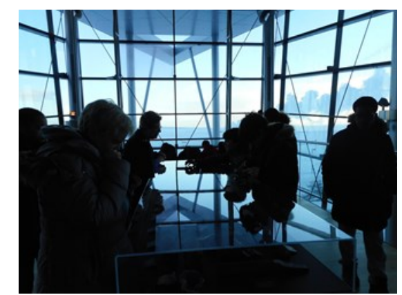
Geographers studying minerals at the Geothermal power plant. 30% of the energy is Iceland is geothermal the rest is hydroelectric.

First stop in the day was the On geothermal energy plant where volcanically heated water is used for energy and hot water supply.