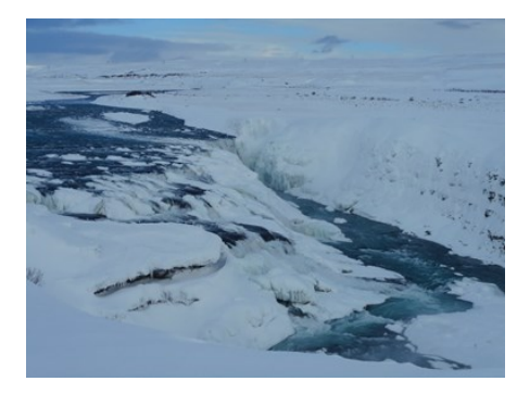
The frozen two tier Gullfoss waterfall. In the summer the spray makes a rainbow that stretches across the bottom tier.

From Geyser we travel to Gulfoss (The golden waterfall). A double tied waterfall. We got to experience the impact of tourism as Dori had to negotiate around some careless tourists who used the main road as a carpark! Is Iceland managing mass tourism was a question we asked.