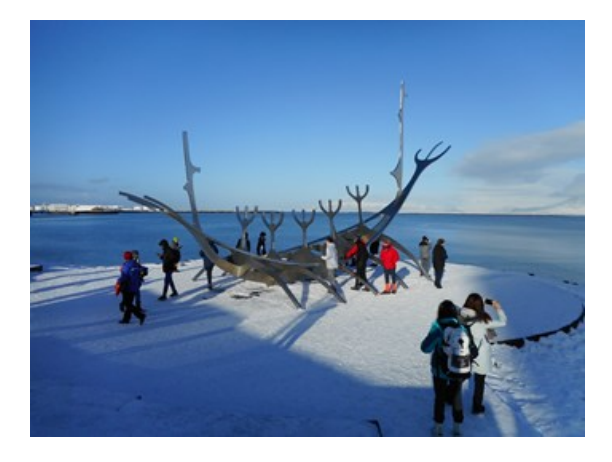
The sun voyage statue is meant to represent progress, freedom and hope! The backdrop of snowy mountains and fishing boats is certainly very tranquil despite this being the capital city.

Next stop was Katy's favourite building. The Harpa concert hall. The Harpa Hall construction was started in 2007 just as the economic recession started. When the economic crash happened the building work stopped until private and public finances were found. It was eventually finished in 2011.