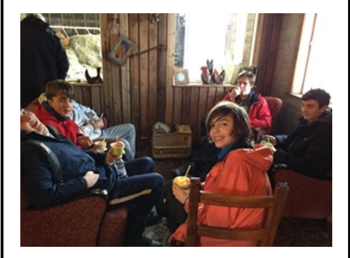
Eating the homemade icecream at Efstidalur farm.

From Gullfoss we logically, in -10°C, drove to a nearby diary farm for icecream! The Efstidalur II farm shows how rural businesses have to diversify to make money. The farm has been in the same family since 1850 and has been a diary farm since then; but it now offers ice cream, a top end restaurant, cooking classes, horse riding, stables, BnB and tour guides.