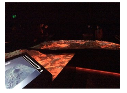
The interactive displays included an amazing floor to ceiling volcanic plume demonstrating how Iceland was situated on a volcanic hotspot.