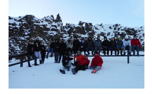
Trinity's attempt to recreate the first Parliamentary meeting between the Viking Clans in 930!

As we walked down in the snow covered rift we could see plenty of signs of tectonic activity in the geology.