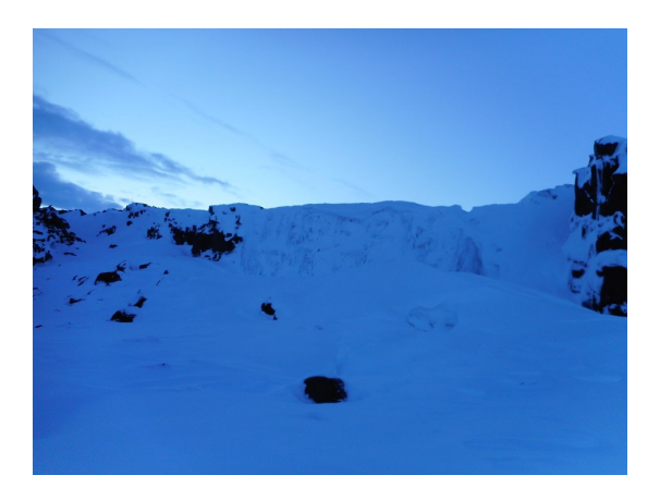
Frozen waterfall in the National Park.

As we missed out on one waterfall the previous day Katy took us to hidden waterfall off the tourist trial. With a small hike up an icy path we came to a spectacular frozen waterfall. The power of nature to freeze water in time is evident everywhere!