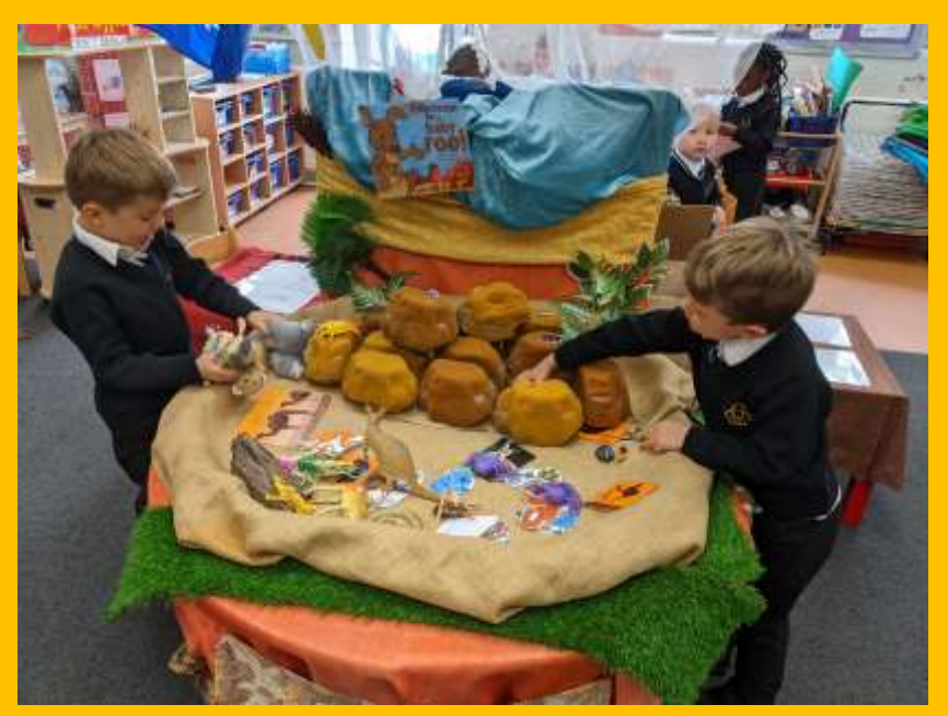
We were in the outback mate!

In science, children focused on the properties of materials. They enjoyed learning about what it means for materials to be hard, soft, bendy or rigid. They then applied their learning the rest of the week, often bringing us different equipment or toys and telling us their properties!